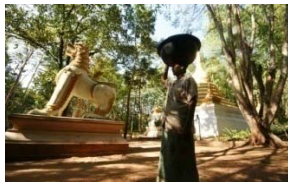
Mon Village & Mon Temple