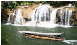
Saiyoke Yai Waterfall