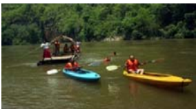
Bamboo Rafting or Canoeing