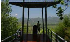
Hellfire Pass Memorial Museum