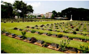
Allied War Cemetery