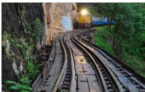
Death Railway Train