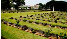
Allied War Cemetery