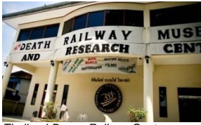
Thailand-Burma Railway Centre