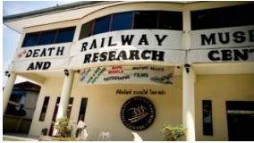
Thailand-Burma Railway Centre