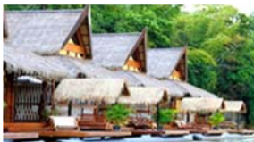
The FloatHouse River Kwai