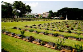
Allied War Cemetery