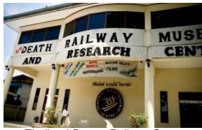
Thailand-Burma Railway Centre

Highlight: Thailand–Burma Railway Centre, War Cemetery, River Kwai Bridge, Jungle hiking ,Mon Tribal Village & Temple, Weary Dunlop Museum, Death Railway Train and Stay at Home Phutoey River Kwai