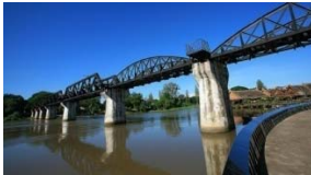
Bridge over the River Kwai