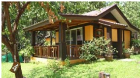
Home Phutoey River Kwai