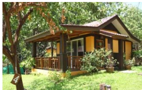
Home Phutoey River Kwai