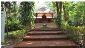
Weary Dunlop museum