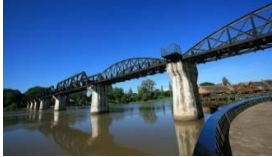
Bridge over the River Kwai