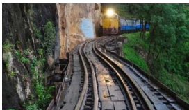
Death Railway Train