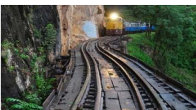
Death Railway Train

Highlight: Thailand–Burma Railway Centre, War Cemetery, River Kwai Bridge, Fly in the park, Weary Dunlop Museum, Jungle hiking, Bamboo Rafting or Canoeing, Mon Tribal Village & Temple, Death Railway Train and Stay at Home Phutoey River Kwai & FloatHouse River Kwai