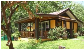
Home Phutoey River Kwai