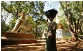
Mon Village & Mon Temple