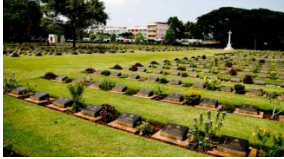
Allied War Cemetery