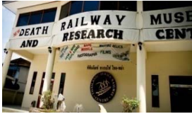
Thailand–Burma Railway Centre

Highlight: Thailand–Burma Railway Centre, War Cemetery, River Kwai Bridge, Hellfire Pass Memorial, Saiyoke Yai Waterfall & National Park, Lawa Cave, Mon Tribal Village & Temple, Jungle hiking, Death Railway Train and Stay at Home Phutoey River Kwai Resort