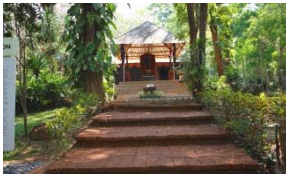
Weary Dunlop museum