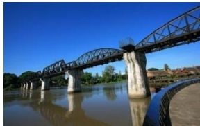
Bridge over the River Kwai