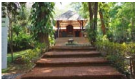
Weary Dunlop museum