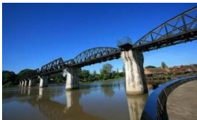
Bridge over the River Kwai