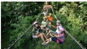
Fly in the Park