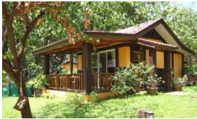
Home Phutoey River Kwai