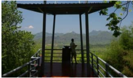
Hellfire Pass Memorial Museum